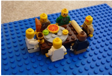
The Last Supper (looks like a few disciples are missing...)