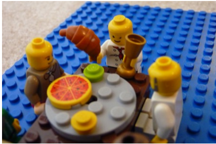
Jesus offering some BIG bread and wine.