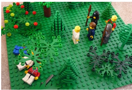
The Garden of Gethsamane – notice Peter passed out next to the sword